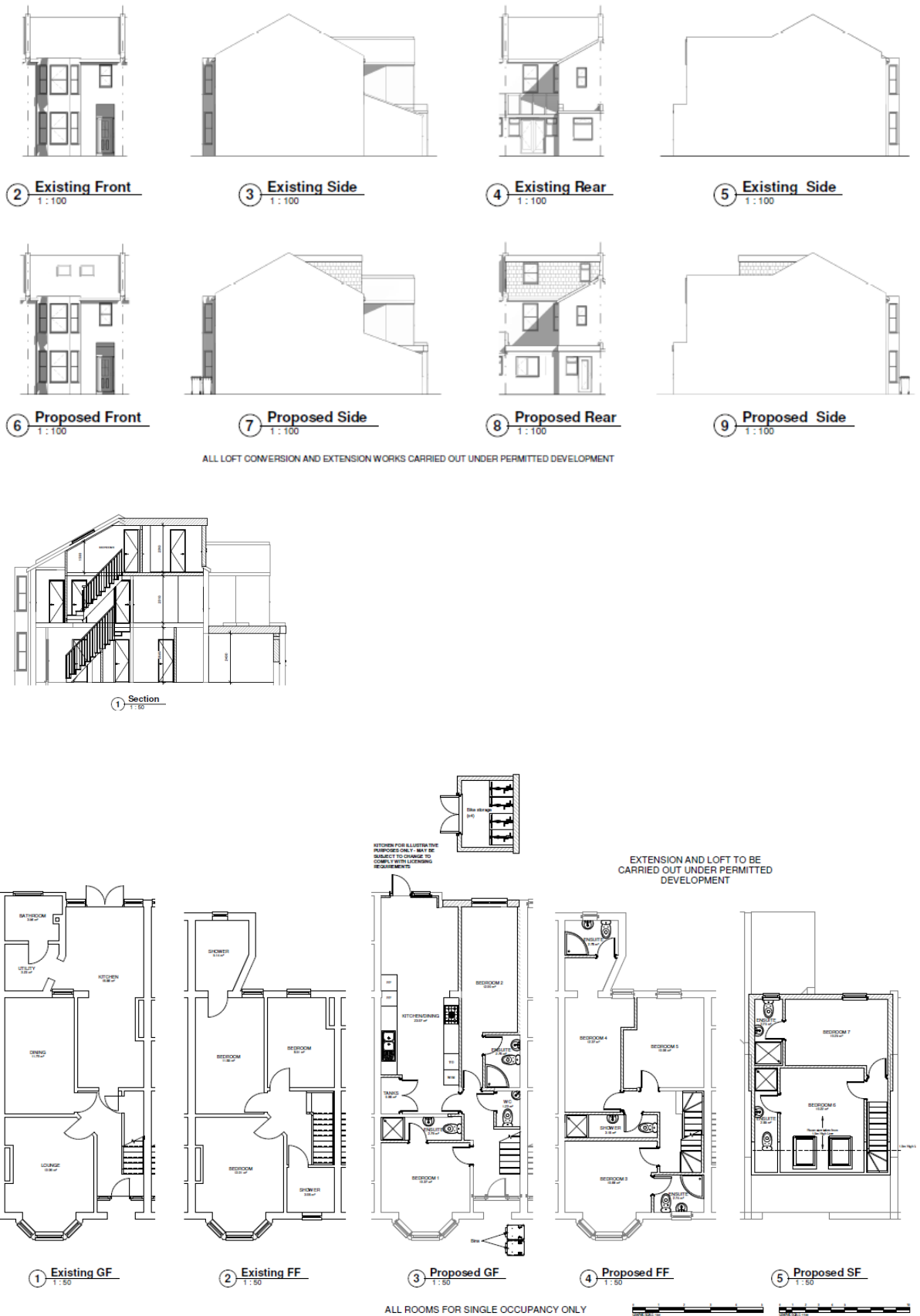
Figure 2 Existing and Proposed Floor Plans & Elevations

committee be minded to grant permission requiring that the permitted development works take place prior to the property's occupation as a HMO for 7 persons.