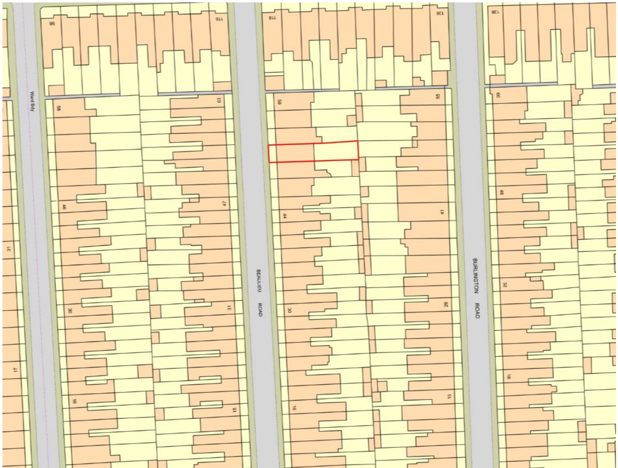
Figure 1 Location plan